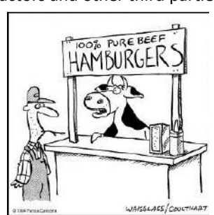
"What conflict of interest?!

The need to prevent actual and perceived conflicts of interest applies to the Board, CEO and staff— as well as contractors and other third parties.