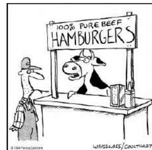
"What conflict of interest?! I work here in my spare time."

The need to prevent actual and perceived conflicts of interest applies to the Board, CEO and staff– as well as contractors and other third parties.